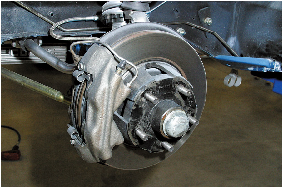
Most mainstream classic cars need little more than these cast-iron caliper, OEM-style disc brakes, and having them only in the front is usually a sufficient upgrade for normal driving. This is a Kelsey-Hayes fourpiston front disc brake on a classic Mustang.

When you're considering a disc brake upgrade, first determine if your car was ever available with disc brakes; if you determine it was not, investigate further to see if a system from a later version of your model offered discs.